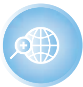
MOTOTRBO Location Services